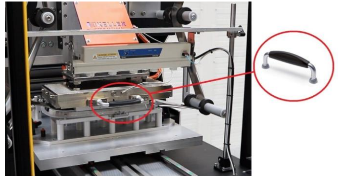
Application of MMT. handle on Keller HS K-Desk Precision machine

KELLER ( www.e-keller.pl ) – Polish company based in Dąbrówka – specialized in the production of machines for industrial printing processes for various sectors, costumer of the subsidiary Elesa+Ganter Polska (one of the Elesa subsidiaries of the joint-venture Elesa+Ganter) was looking for a solution: a handle which allows the manual extraction of the heating plate (which reaches a temperature of 250°C), used for heating the moulds, without having to wait for long cooling times. Ideal solution to reduce mould change times and facilitate their replacement.