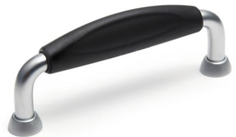
MMT. Handles for heat insulation in steel and technopolymer

Designing solutions that guarantee the highest level of safety and comfort, it is now a prerequisite for design. The health and the safety of the operator in work environments, especially those in which the operator is exposed to conditions that could harm him, such as in the case of Keller exposure to high temperatures, are fundamental factors of which designers of machines and equipment have to deal with until the first stages of a product development.