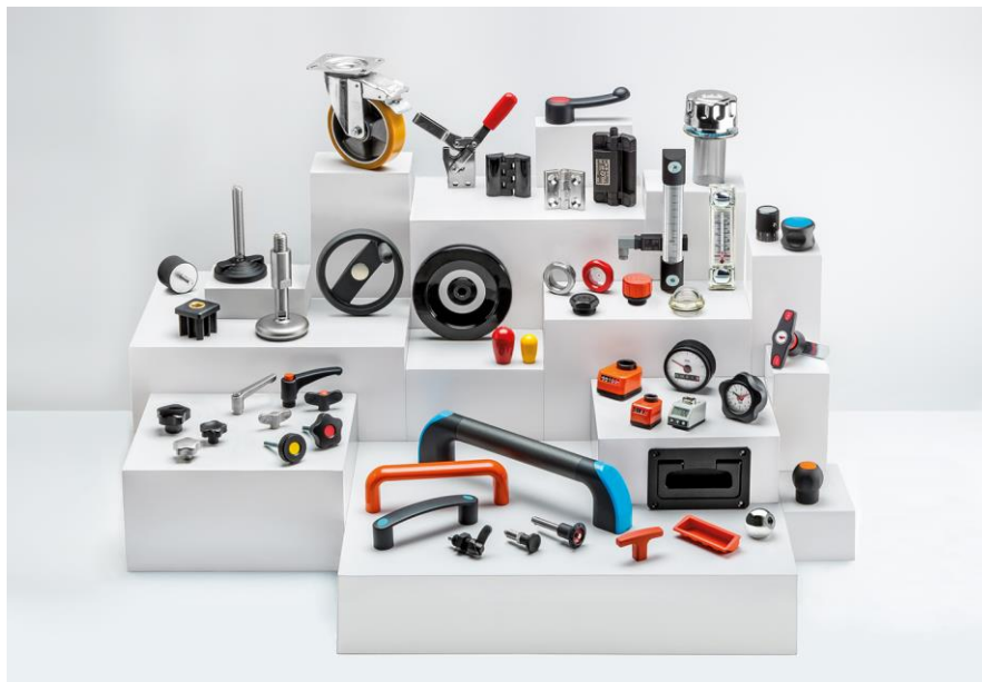
ELESA standard components range

Once again, the range of Elessa standard components has demonstrated to be able to meet specific customer needs, without having to resort to particular customizations.